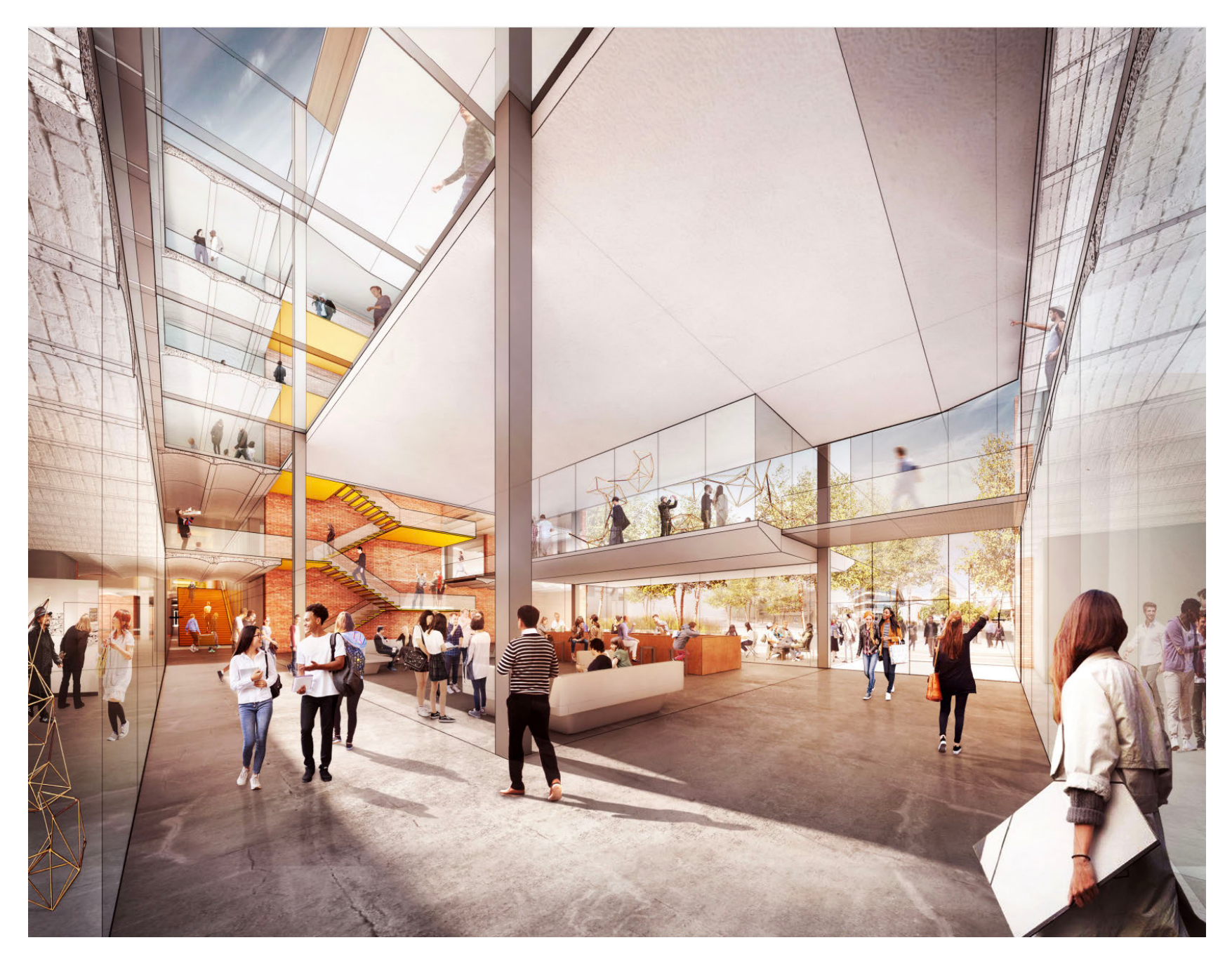
The towering lobby space welcomes visitors and sets the tone for the building.