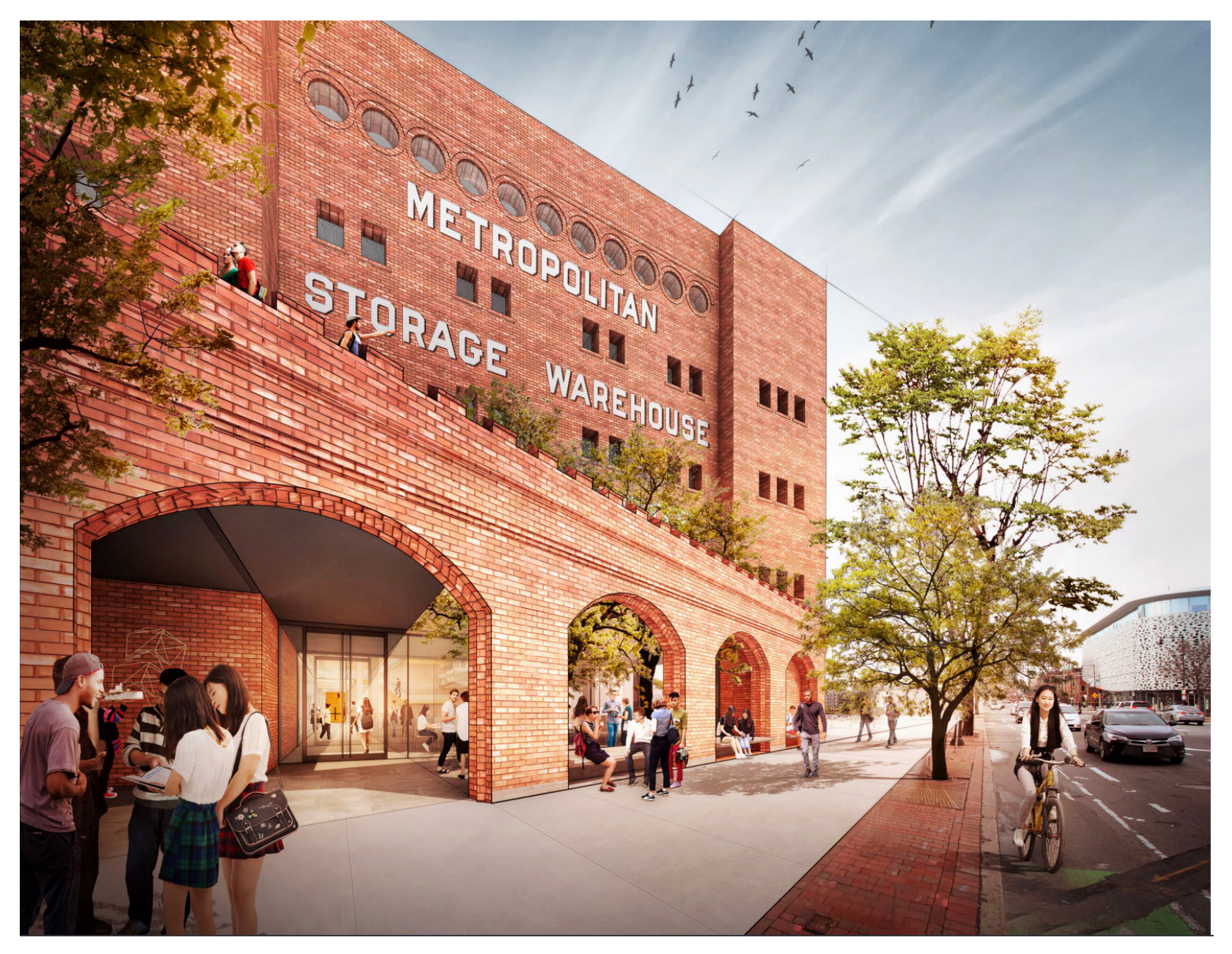
The Met Warehouse resides at the nexus of Massachusetts Avenue and Vassar Street. This image reveals the new entrance to the building.